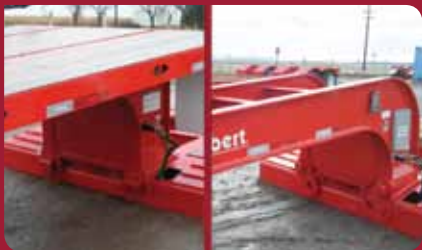
Sliding pin or swinging teardrop connections available for enhanced tractor compatibility.