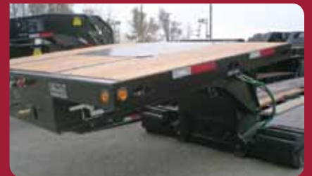
Multiple gooseneck options – mechanical, hydraulic or fixed – customized to your hauling needs.