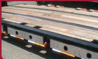
Ultra-low deck height for unmatched clearance and simplified route logistics. (pictured with optional aluminum pullouts)